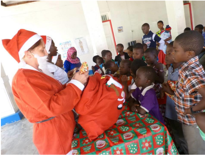
Here are some photos from previous gift days.

We realise you already give so much and it's an expensive time of year so please don't feel obliged in any way.