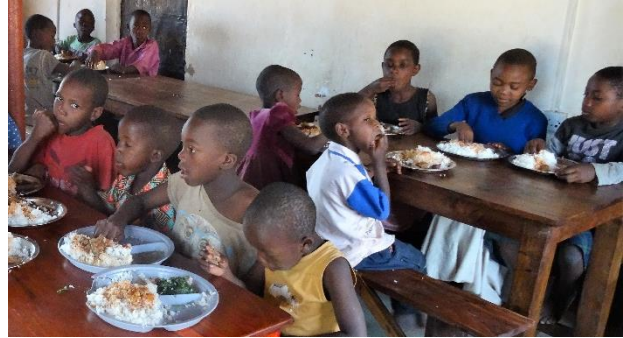
Can that small person above eat all that?