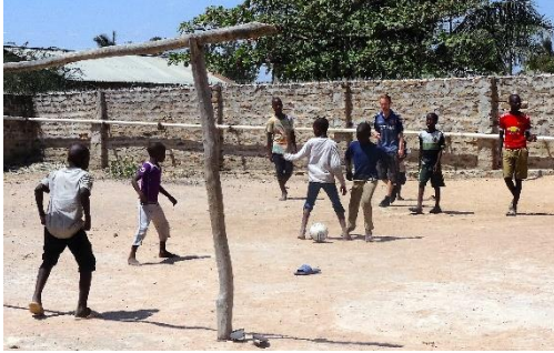
Football usually includes willing visitors