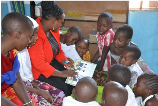
Everyone loves a story.