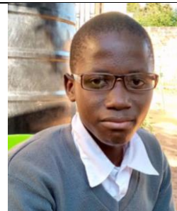
Ngambo students above