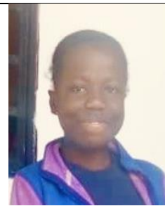
Chem Chem students above