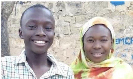
Isevy students above

Before starting secondary school the students will undertake a course in English to prepare them for having all their lessons taught in English.