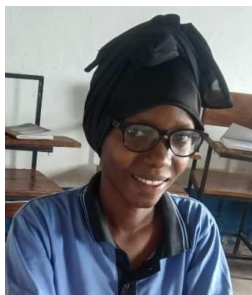
Mwanaidi: Certificate Level in Hotel Management