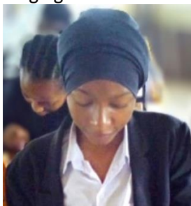
Mwamvitha: Certificate level in Hospitality