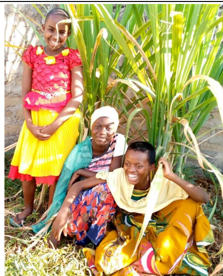
But sadly our children are not always all blest with good health and 4 of our children need specialist medical attention see overleaf.