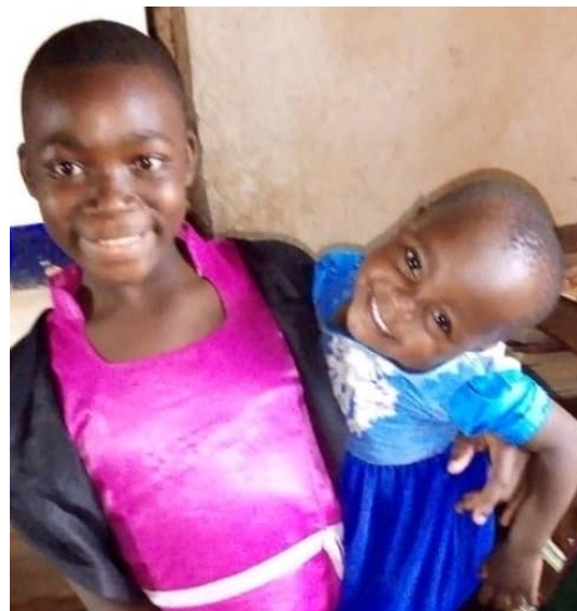
Smiles and hugs for everyone. Our newest babe, right, has finally let go of her brother and found herself a new "big sister" and is enjoying being a TLC kid.