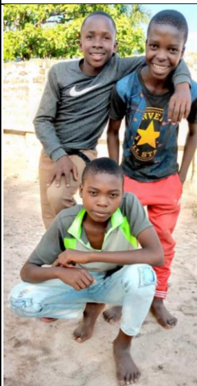
Happy healthy children, TLC's speciality!