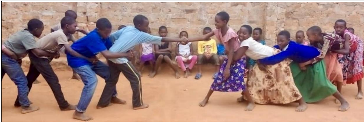
Boys versus girls above (the girls won!). They need a rope!